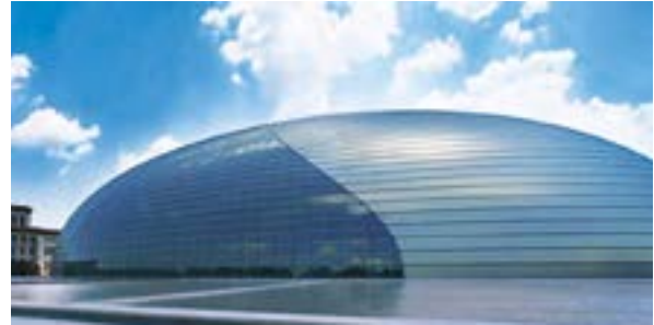
National Grand Theater, Beijing, China