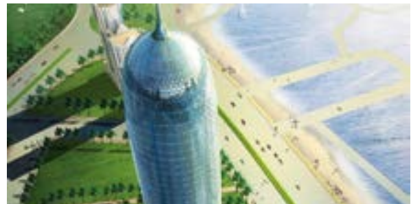
Doha High Rise, Doha, Qatar