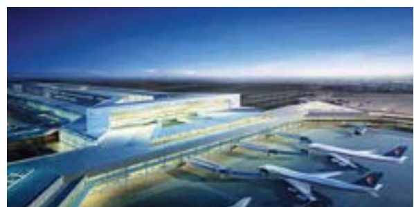
Hongqiao International Airport and Transportation Junction, Shanghai, China