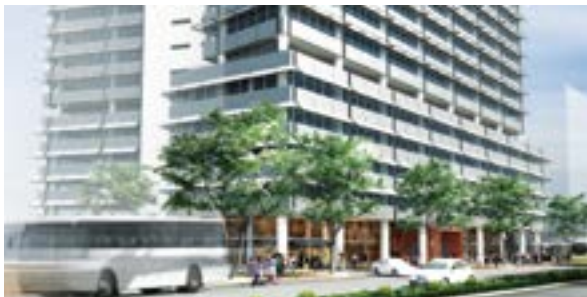
Centrepoint, Ho Chi Minh City, Vietnam