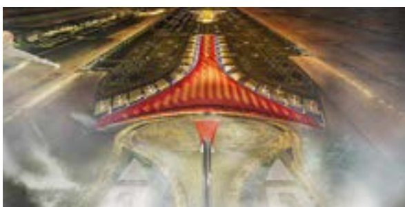
Beijing Capital Airport, Beijing, China