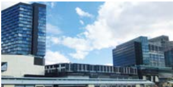
South Wharf, Melbourne, Australia