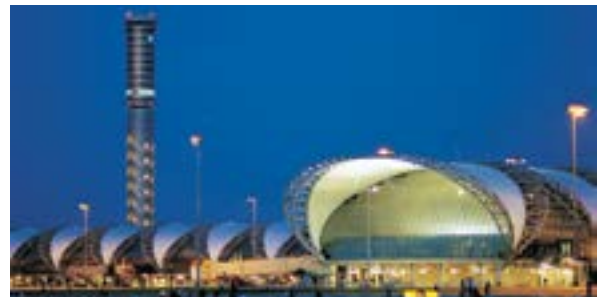
Suvarnabhumi Airport, Bangkok, Thailand